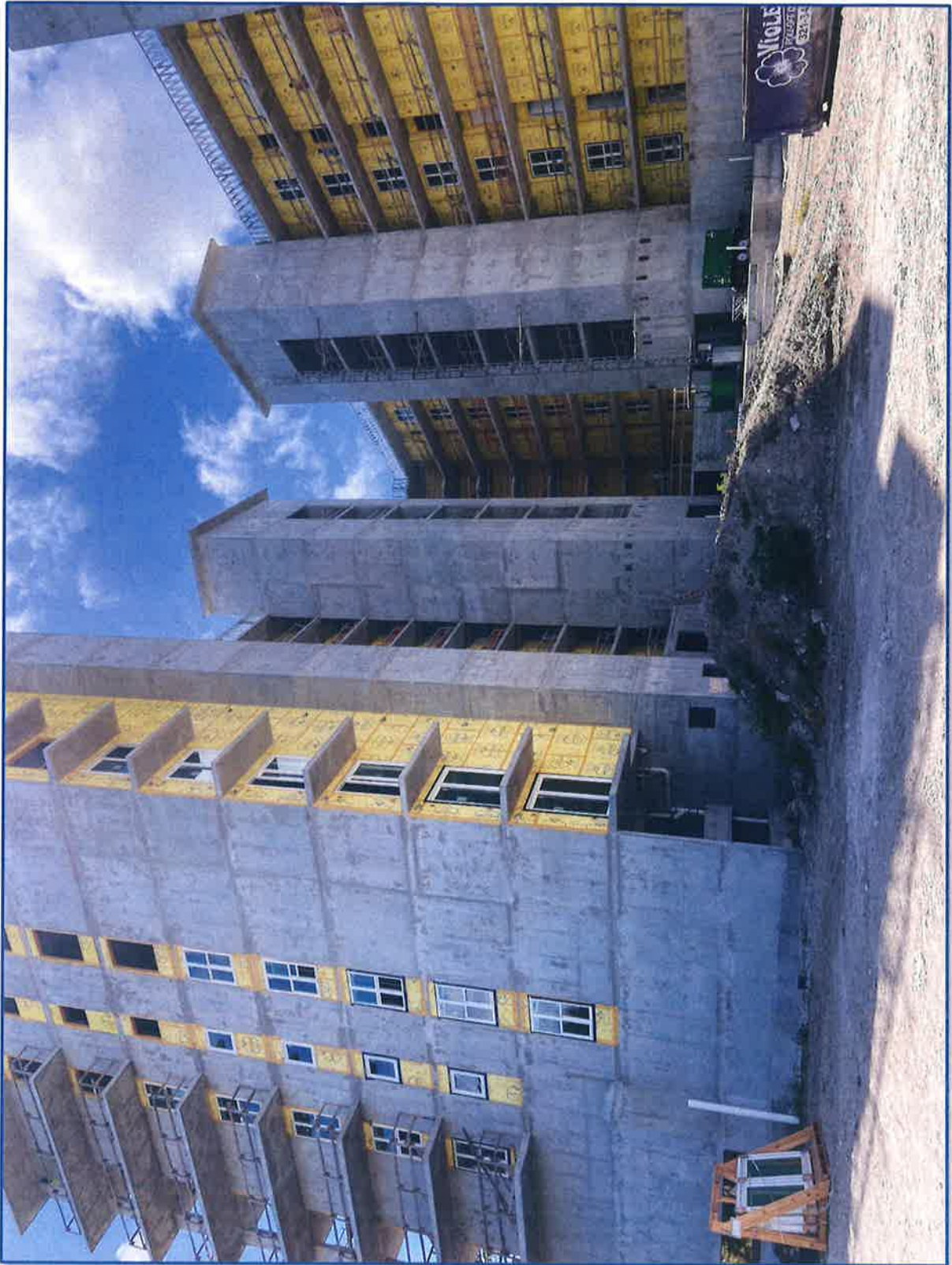
Sam Leighton 06/01/22