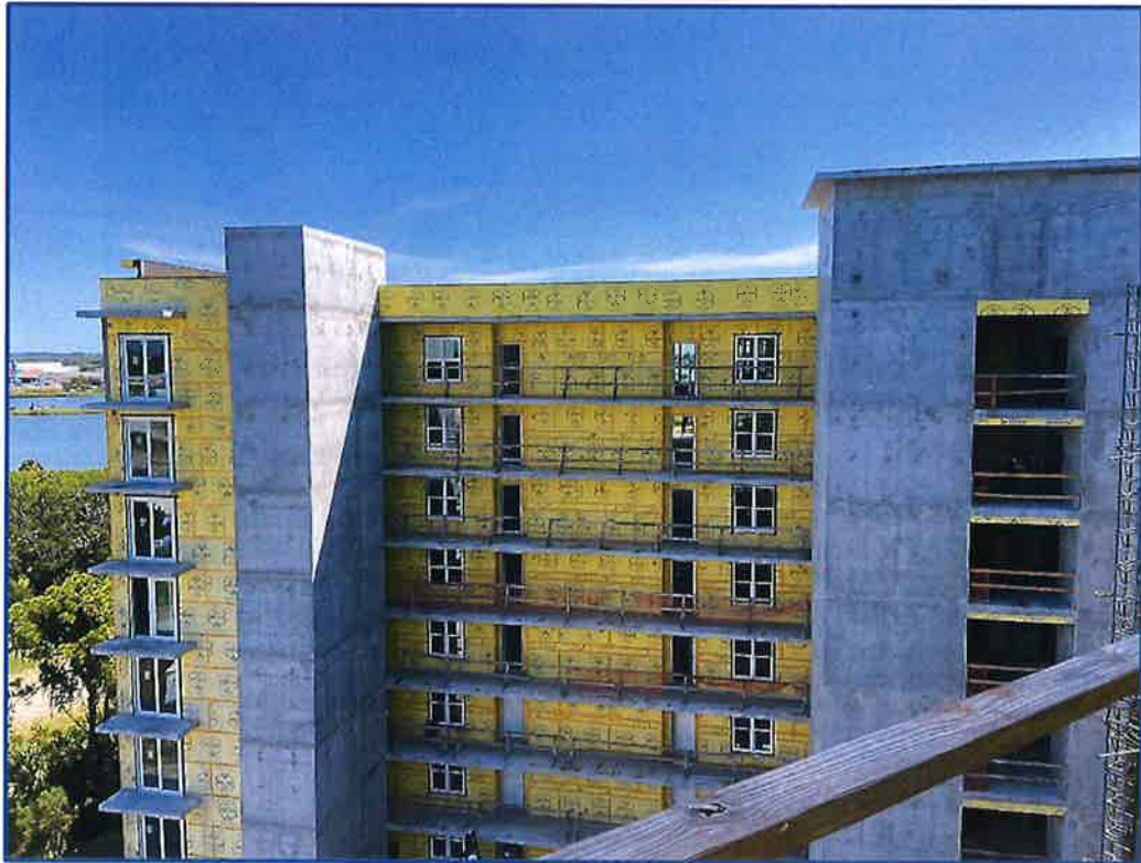
Samuel Leighton 08/03/22