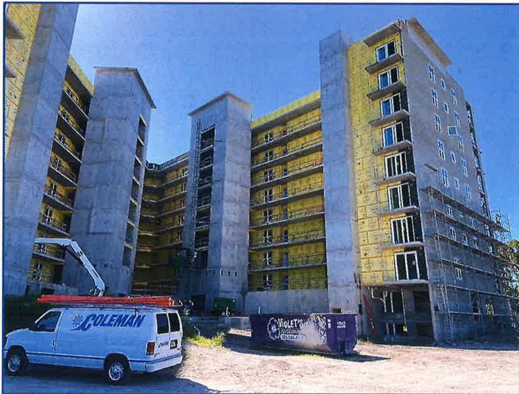
Samuel Leighton 08/03/22